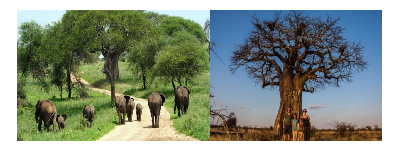
Accommodation: Dinne & overnight at Farm of dream lodge